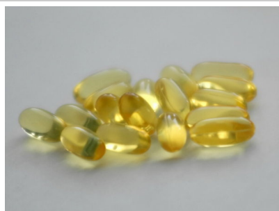
For heart health, fish oil pills not the answer: study