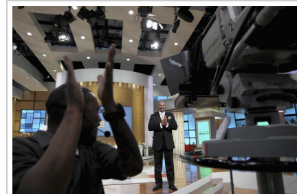
Steve Harvey keeping it real with new daytime TV talk show