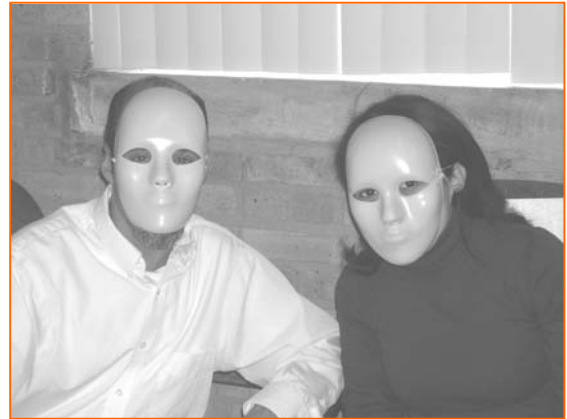
Left: CTI Training Staff and speaker meet to discuss up-coming training. Right: Cook County Probation Officer training participants take part in a role play activity.

As the training and education program of The Network, the Centralized Training Institute (CTI) plays a key role in fulfilling our long-term mission and strategies. The primary focus of our training is to prepare participants to effectively respond and deliver quality services to victims of domestic violence and their children. The Centralized Training Institute provides the latest theory and practice in the field using adult centered educational methodologies, within an anti-oppression framework. CTI is an official certified training site for domestic violence professional workers, and is considered a model of Illinois 40-Hour training programs. CTI has demonstrated excellence in the development of training curricula and professional comprehensive training for over ten years.