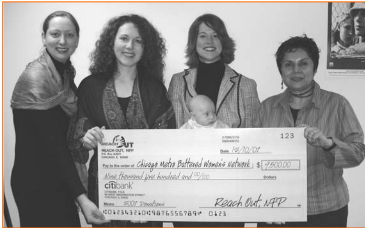
Check presentation with Reach Out NFP